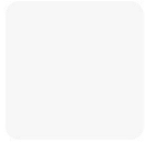
S - 115 White