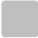
S - 235 Silver