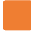
S - 169 Orange