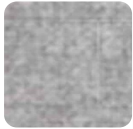
Backrest: SF - 1103