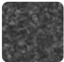
PET Panel: GP - 04