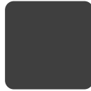
S - 211 Black