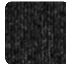
Carpet: FP1 - 1