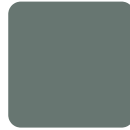
S - 201 Green